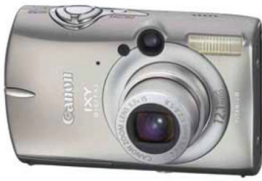
Photo 2 Digital camera with titanium body Canon IXY, provided by CANON, Inc.

In the field of sports, golf clubs are a representative application of titanium. Furthermore, the SLE rule (an official rule regulating the restitution coefficient of driver's clubfaces) was introduced in 2008, as a result of which the use of \beta -type titanium alloy that had been the most popular because of its high restitution coefficient was prevented. Under that condition, Nippon Steel & Sumitomo Metal proposed its originally developed titanium alloy "Super-TIX™51AF" featuring small specific weight, superior strength, and high Young's modulus. The new titanium alloy is used for golf clubs ( Photo 3 ) of SRI Sports (the present Dunlop Sports Co., Ltd.). 3) For a detailed description of this titanium alloy, please refer to the separate article under "Development of Ti-Al-Fe Based Titanium Alloy Super-TIX™51AF Hot Rolled Strip Products" in this special issue.