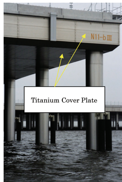
Photo 9 Titanium cover plates for corrosion protection installed on the rear and the side walls of Runway D of Haneda, Tokyo International Airport