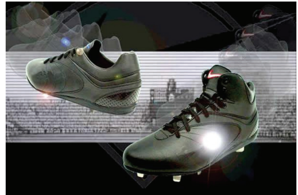
Photo 4 Baseball shoes with titanium spikes "NIKE Air Zoom Vaper J Leather", provided by NIKE, Inc.