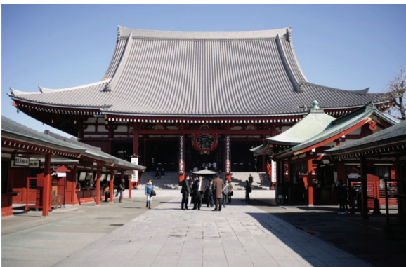
Photo 6 Titanium roof of Sensoji Temple Main Hall

As a recent application example, “titanium cover plate” takes advantage of the excellent seawater resistance of titanium. The titanium cover plate is used for D Runway of Tokyo International Airport, which was put into service in December of 2010. The cover plate is a panel consisting of a nonflammable urethane core sandwiched between a titanium sheet and a painted steel sheet. It is applied to the rear and side walls of the runway pier ( Photo 9 ). In a