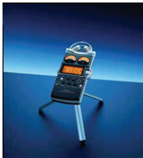
Photo 1 Linear PCM recorder with titanium body

First, there is the titanium casing of IT devices. From the very beginning, titanium was considered suitable for the casing of IT devices because its feel, quality, and color were judged as desirable in terms of a material for the purpose. Besides, titanium was known as a material having a number of superior properties such as small specific weight, high strength, excellent corrosion resistance, no risk of causing metallic allergies. However, titanium had the problem of being slightly poor in workability for IT devices. The company solved that difficult problem by developing ultradeep-drawing titanium “Super-PureFlex™” and providing user support utilizing even press simulation techniques. As a result, thin sheets of titanium of Nippon Steel & Sumitomo Metal were adopted in succession for the casing of Sony’s Network Walkman in 2003, Sony’s Linear PCM Recorder in 2006 ( Photo 1 ), Canon’s digital camera in the same year ( Photo 2 ), and Sony’s Digital HD Video Camera Recorder in 2008. 2)