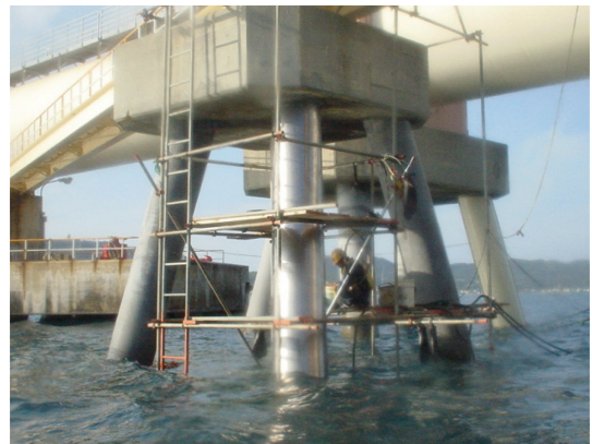
Photo 8 Example of employment of TP construction method