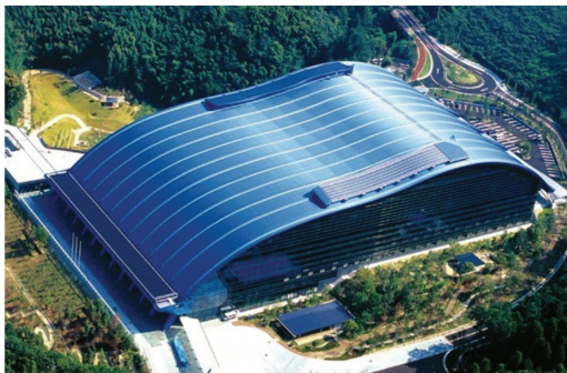
Photo 7 Titanium roof of Kyushu National Museum