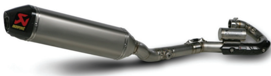
Photo 10 Super-TIX™10CUNB applied muffler example for motorcycle

highly corrosive environment, the steel girders on the jacket that supports the runway are covered with titanium cover plate and the humidity in the internal space is properly controlled to prevent corrosion of the steel materials used. Thus, the titanium cover plate takes advantage of the superior corrosion resistance of titanium. This was a large-scale project involving a total area of 570,000 m 2 and titanium consumption of some 1,000 tons.