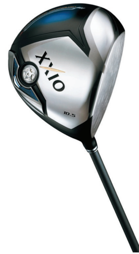
Photo 3 Super-TIX™51AF applied golf club "XXIO7", provided by Dunlop Sports Co, Ltd.

Now, let us move into the second field in Fig. 1. This field represents a growing area in which the properties of titanium are im-