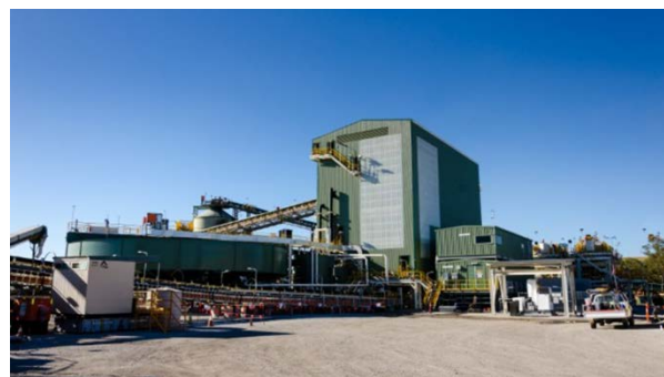
Coal Handling and Preparation Plant

Due to its stability of supply and economic efficiency, coal will continue to be an important energy resource and have a major role in energy mix in long-term energy supply-demand outlook. By supplying good environmental feature coals produced from the mine to electricity power and steel industries in a long term and stable manner, we will contribute to sustainable growth in the industries including steel industries in Asia and also energy security in Japan.