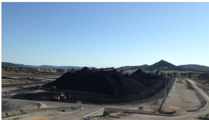
Product Stockpile Areas